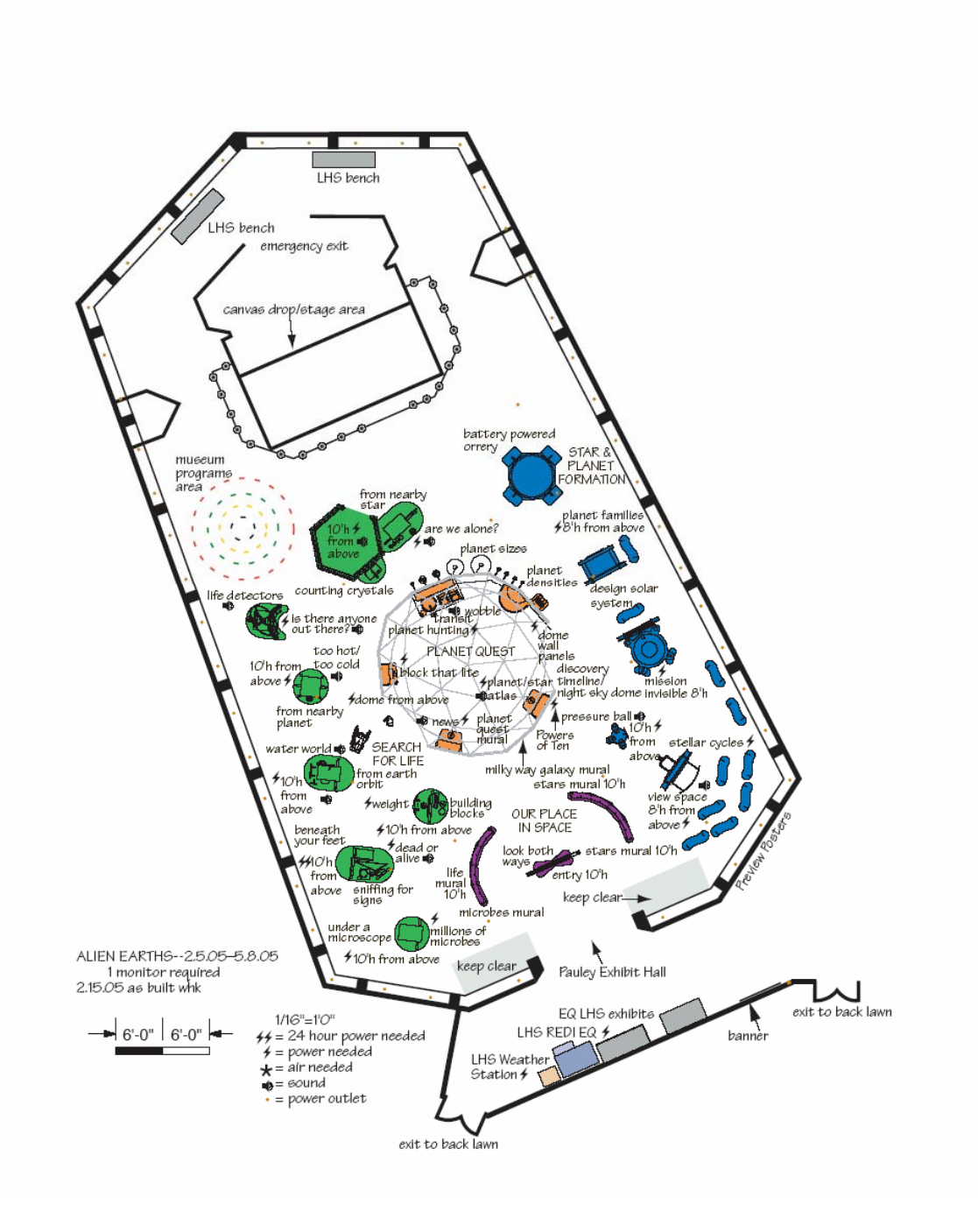
Exhibit Floor Plan at Lawrence Hall of Science