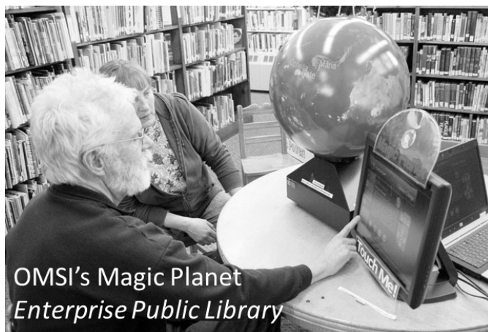
Figure 4: LEO exhibit component.

For over ten years, the Oregon Museum of Science and Industry (OMSI) has partnered with Oregon libraries to better provide urban neighborhoods and rural communities with STEM resources, programs, exhibits, and professional development. In addition to providing safe spaces and supporting resources, libraries provide an arm into the community and greatly reduce the time necessary to build trusted community relationships. Through collaborations with the Libraries of Eastern Oregon (LEO) and Multnomah County Libraries (MCL), OMSI is able to focus on providing innovative STEM programs far beyond the limitations of the museum walls. Programs to date have included professional development for librarians, workshops for teachers, connections to researchers and experts through video-conferencing and onsite programming, special events with portable planetarium programs, showcases for small “ta-