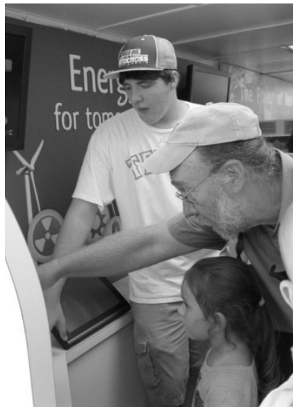
Figure 5: Energy exhibit in the Trailblazer van.

Science Rocks is collaboration between TAME, Connecting Texas Libraries Statewide (CTLS, Inc.) and the Texas State Library and Archives Commission. IMLS supports this endeavor through several funding sources. Over the course of two summers this collaborative project has taken TAME’s Trailblazer van into 67 communities across Texas. Another 23 public libraries are scheduled for visits from the Trail-