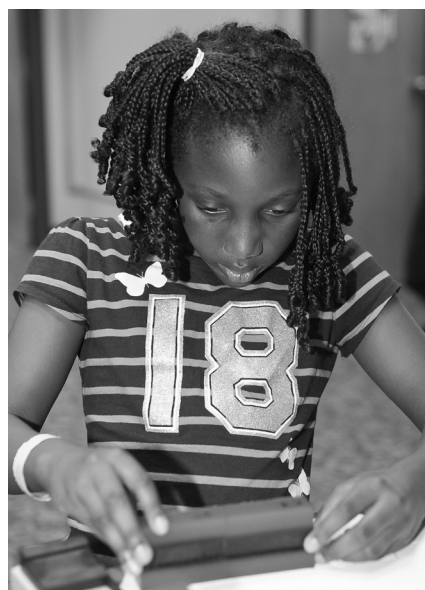
Figure 3: Discover Tech patron.

(STAR_Net) is a national program led by NCIL. STAR stands for Science-Technology Activities and Resources ( www.starnetlibraries.org ). Core partners include the American Library Association, Lunar and Planetary Institute, and the National Girls Collaborative Project. Other partners include the After school Alliance, National Academy of Engineering, Engineers Without Borders-USA, Institute of Electrical and Electronics Engineers (IEEE-USA), the National Renewable Energy Lab, American Geophysical Union, Geological Society of America, and many more. Phase 1 of the STAR_Net project is supported through a grant from the National Science Foundation. The project has developed two inter-