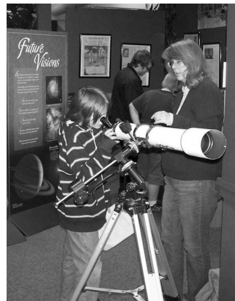
Figure 6: A Visions outreach event.

Visions of the Universe was developed by STScI (Baltimore, Maryland), the Smithsonian Astrophysical Observatory (Cambridge, Massachusetts), and ALA through funding from NASA. The exhibit is part of a multi-year global celebration of astronomy, highlighted by the 400th anniversary of the first use of an astronomical telescope by Galileo. The goal of the continuing celebration is to create awareness of astronomy’s impact on society and culture, and stimulate young people’s