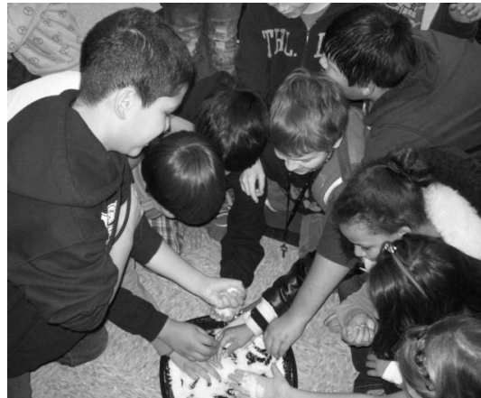
Figure 1 (above): Library patrons participate in a Discover Earth program.