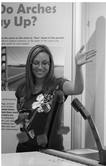
Figure 6: A Visitor builds an arch and then takes it down.

Visitors can choose from several inspirational videos showing members of Engineers Without Borders (EWB) using their skills to profoundly improve the quality of life for communities in Central America, South America, Africa, and Asia. Exhibits also address the importance of energy in modern society. For example, using a hand-crank generator, visitors can produce electrical energy that can be used to power various types of light bulbs and learn which one uses the least energy to operate. Nearby, the Solar Power station demonstrates the basic functioning of solar energy by allowing visitors to experiment with a light source and a large solar panel.