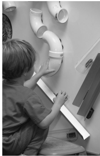
Figure 8: A young engineer at work in the Discover Tech exhibit.

It's clear that interactive STEM experiences in libraries can be an effective way to reach under-served audiences and increase STEM content knowledge and interest in STEM careers. Broader participation success will come from libraries offering relevant STEM programming and forging strategic partnerships with community institutions that reach under-served populations. OST programs are especially well-positioned to help close the opportunity gap that many children and youth from under-served and underrepresented communities face (Afterschool Alliance, 2011). Of the 8.4 million children in OST programs, ethnic minority children are more likely than others to participate (Afterschool Alliance, 2011). Libraries are an ideal OST setting to reach the populations the country needs to widen the STEM-pipeline through engaging, interactive