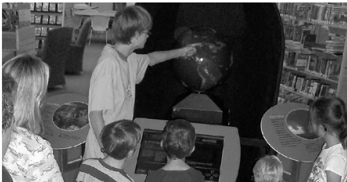
Figure 3: The Magic Planet component in Discover Earth.

Our view of Earth from space has deepened our understanding of the planet as a global, dynamic system. Instruments on satellites and spacecraft, coupled with advances in ground-based research, have provided us with astonishing new perspectives of our planet. The project development team agreed upon the following Big Idea statement (Serrell, 1996) for the exhibition: My Changing World: The global environment changes—and is changed by—our community’s local environment.