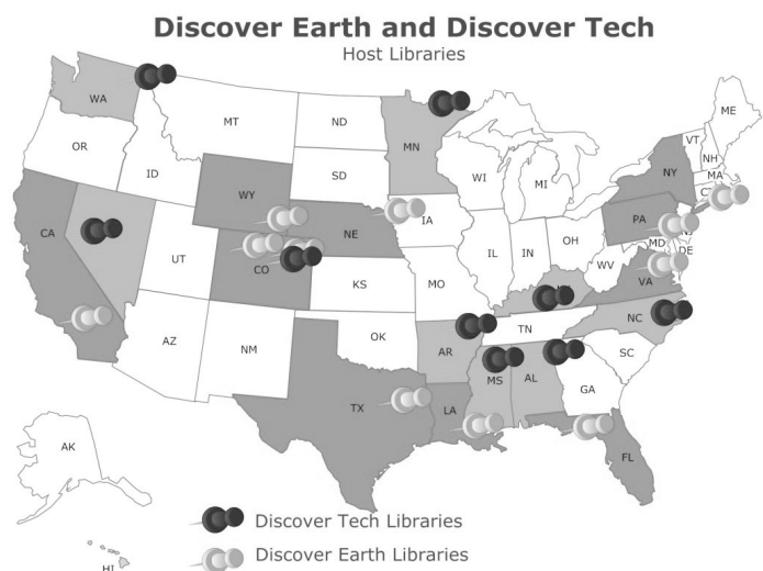
Figure 2 (below): Discover Earth and Discover Tech tour locations

STAR_Net education programs have been designed with the goal to inspire lifelong learning through inquiry and play (Dusenbery, 2013). They include museum-quality, interactive exhibits, along with a rich variety of programming developed by library staff or external partners. Over 140 libraries applied to ALA to host the project's two interactive traveling exhibits: Discover Earth: A Century of Change and Discover Tech: Engineers Make a World of Difference . Only 19 libraries were able to be selected. The project team is