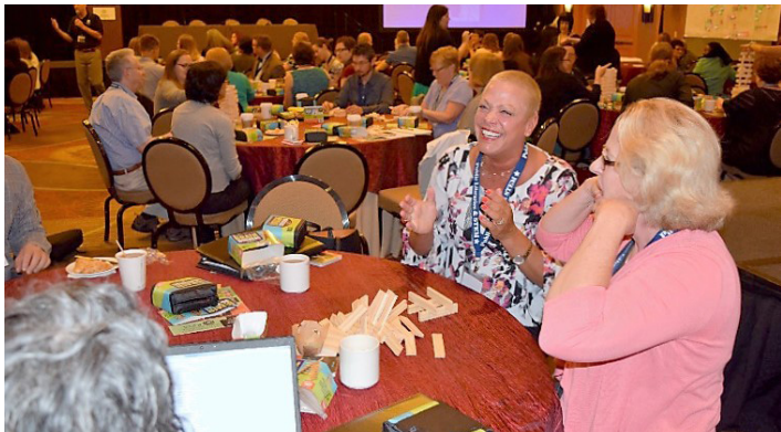
Figure 6: Participant feedback was positive.

Collaboration and ecosystem perspectives were among the most important takeaways listed in a follow-up survey, and 71% (n=56) have contacted new collaborators in the six weeks following the conference. These results are in contrast to the findings from the 2014 survey described above, which demonstrated that most library programming is facilitated by library staff, instead of with and/or by partners. Participants reported the impact of training on collective impact, ecosystem perspectives, and collaboration examples: “The big takeaway for me was to partner, partner, partner, so I plan to work closely with more community groups and the university, rather than try to come up with original programming all the time,” and “My most important takeaway was thinking about the library as a single entity in a larger learning ecosystem.” Representatives from the STEM professions noted: “As a non-librarian, this