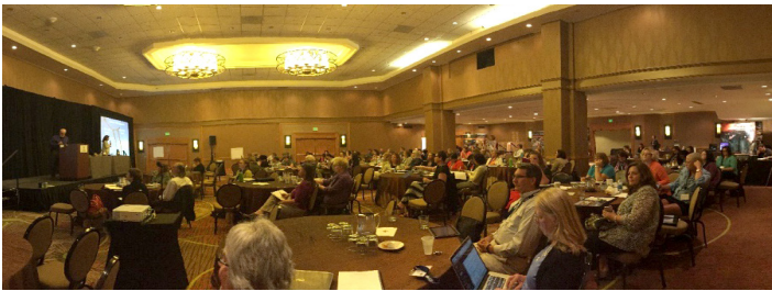
Figure 2: The Public Libraries & STEM conference facilitated strategic partnerships between the community of public libraries and STEM education and research organizations.

themes from the exhibit to local issues. Library patrons improved their knowledge about STEM topics presented in the exhibits and associated programming, and patrons viewing the exhibit reflected the demographics of their communities (Fitzhugh, Coulon, and Elworth 2013).