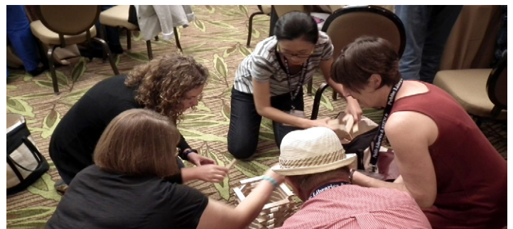
Figure 1: The 2015 Public Libraries & STEM conference was the first of its kind for bringing professionals from the library and STEM professions together. Here, participants engaged in hands-on teamwork with Keva planks.

Races, Maker Spaces, and STEM exhibitions. Building on a long tradition of library-led summer educational programs and reflecting the increased infusion of STEM, the National Collaborative Summer Library Program™ slogan for 2017 is "Build a Better World" and for 2019, the theme will be "Space."